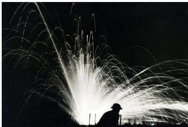
A phosphorous bomb detonated during exercises in Gondrecourt, France, during World War I.

Phosphorus was discovered in the late 17th century by a Hamburg alchemist, Hennig Brand, who inadvertently isolated it while seeking the storied “philosophers’ stone” that would transform ordinary metals into gold. Experimenting doughtily with large quantities of the golden liquid he knew best — human urine — Brand emerged with an eerie substance that lacked any Midas touch but did glow in the dark, prompting Brand to christen it phosphorus, Greek for “bringer of light.”