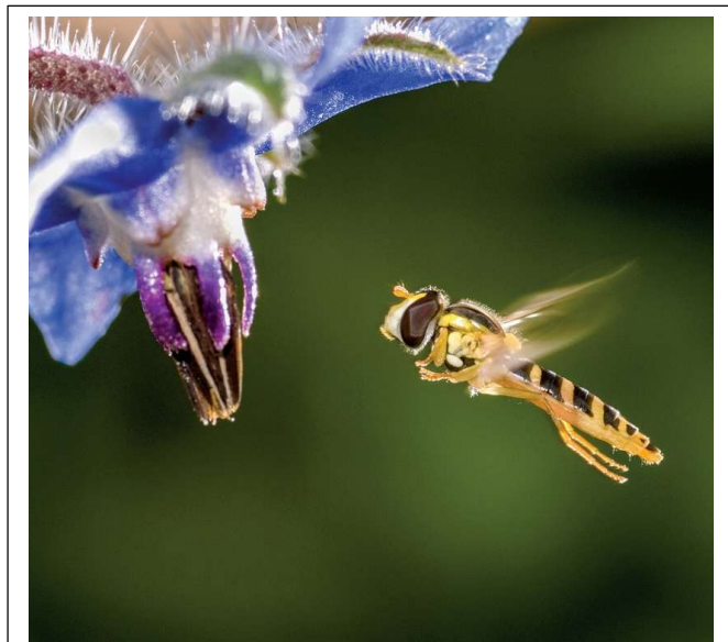
Hover flies, often mistaken for bees or wasps, are important pollinators. Their numbers have plummeted in nature reserves in Germany.

Changes in land use surrounding the reserves are probably playing a role. “We’ve lost huge amounts of habitat, which has certainly contributed to all these declines,” Goulson says. “If we turn all the seminatural habitats to wheat and cornfields, then there will be virtually no life in those fields.”